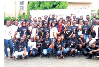
• Youth Digital Advocacy Bootcamp