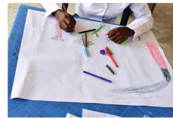
• Fund our future art contest