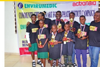
• Fund our future art contest