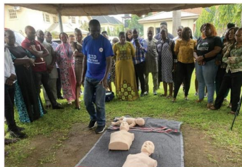
• ActionAid Nigeria's staff training on first aid response.