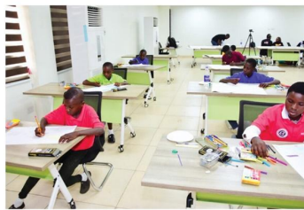
• Fund our future art contest