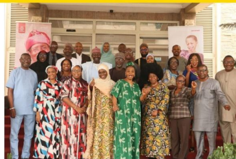
• ActionAid Nigeria's General Assembly at the 13 Assembly meeting held in Abuja in August 2023