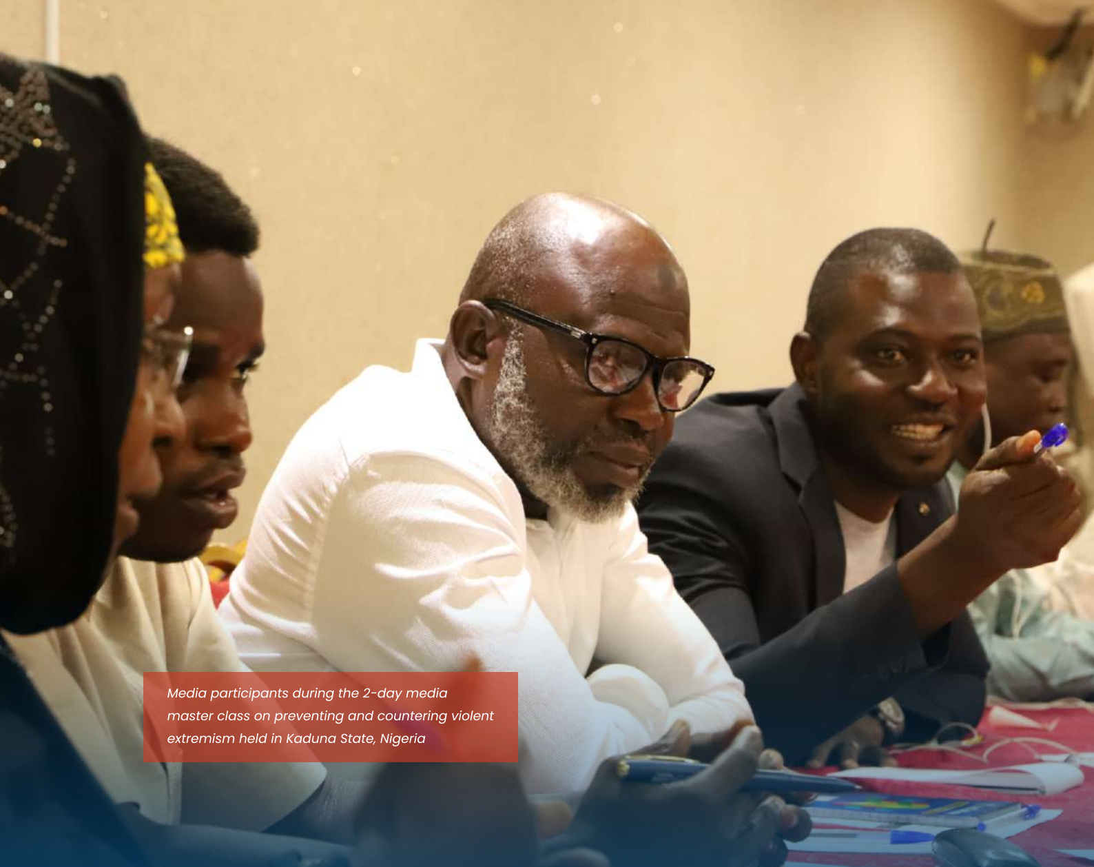
Media participants during the 2-day media master class on preventing and countering violent extremism held in Kaduna State, Nigeria