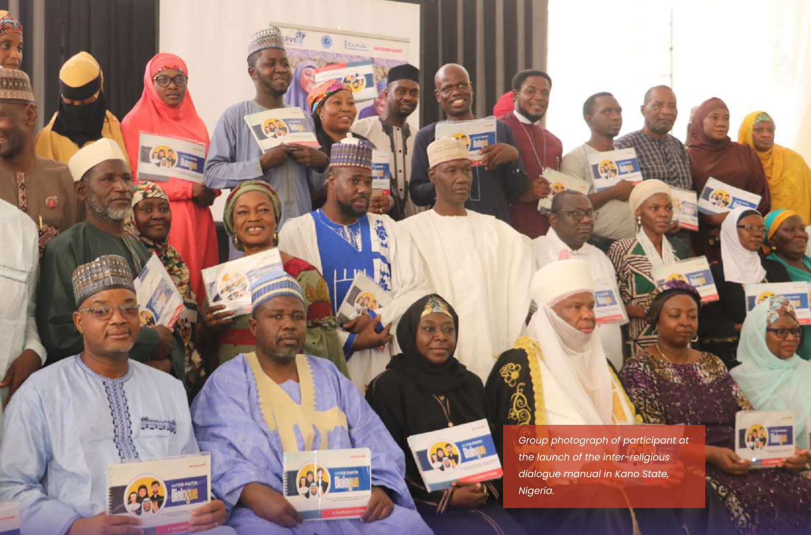
Group photograph of participant at the launch of the inter-religious dialogue manual in Kano State, Nigeria.