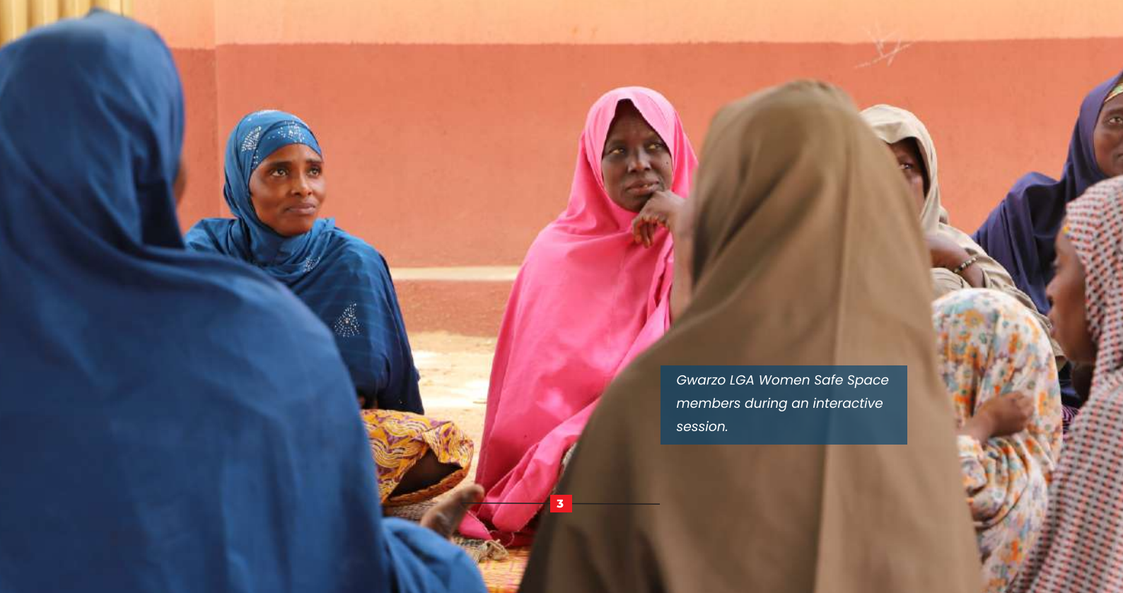
Gwarzo LGA Women Safe Space members during an interactive session.